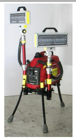
LENTRY LIGHT SYSTEM Model 1SPECSS