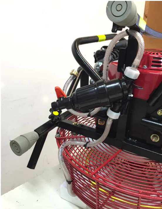
Photo D: View from underneath the fan looking up, to show the routing and position of the Misting Ring on a 20-inch Ventry® Fan.

Please call 888-257-8967 with any questions or for help.