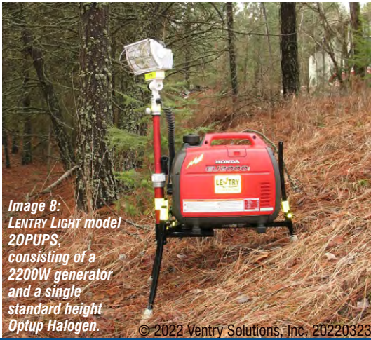
Image 8: LENTRY LIGHT model 20PUPS, consisting of a 2200W generator and a single standard height Optup Halogen.