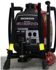
2200W generator with Wheel & Handle Kit