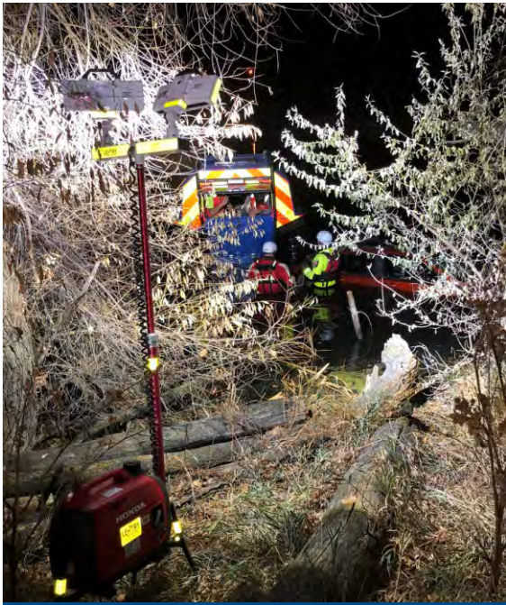
Image 7 (left): LENTRY Model 2TWSPX-C34 (case not shown) lighting the recovery of a submerged vehicle.

“Rated” wattage is the power the generator can supply continuously, while “max” wattage is the supply available for short bursts.