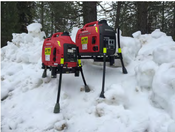
Image 6 (above): 1000W generator (left) and a 2200W generator (right), both mounted on a LENTRY Frame showing how their all-terrain legs keep the generator level while standing on a pile of snow..

The complete line of LENTRY LIGHTING SYSTEMS are covered by a five-year “No BS” warranty from Ventry Solutions, Inc. on workmanship and materials. See individual sections for warranties on generators and light heads. Lifetime warranty on V-Spec Cases. Bulbs are not covered under warranty.