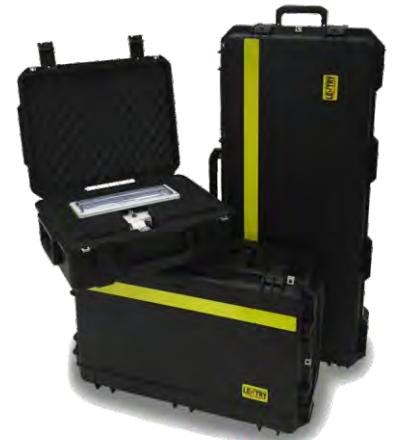
Image 1 (above): V-Spec Cases C2318 (left, top), C3422 (left, bottom), C2318 (right).