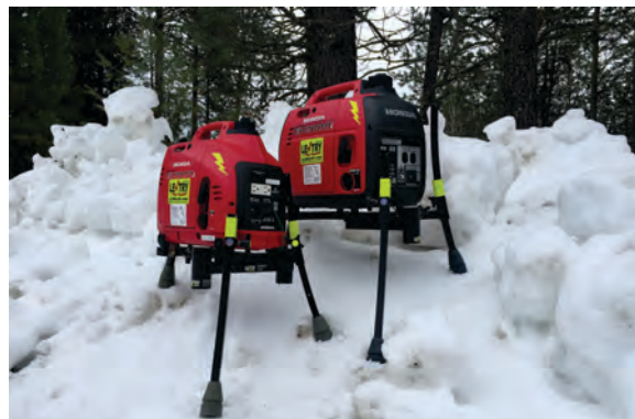
Image 8: 1000W generator (left) and a 2200W generator (right), both mounted on a LENTRY Frame showing off their all-terrain legs.