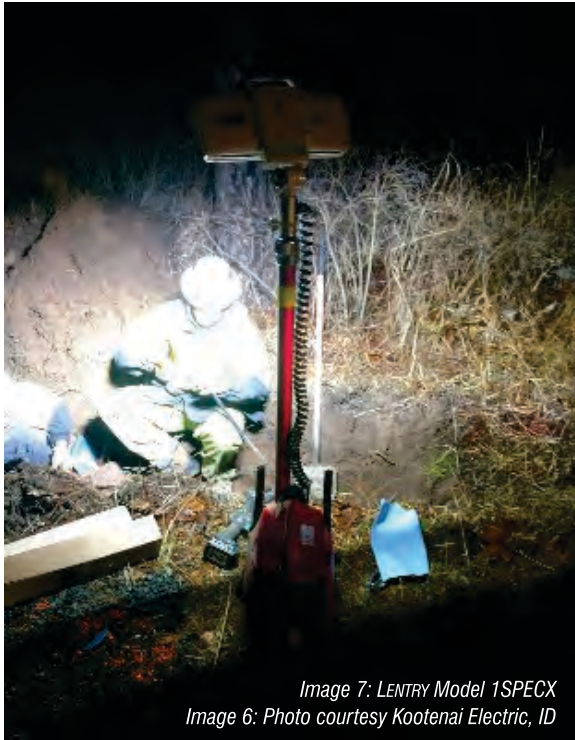
Image 7: LENTRY Model 1SPECK Image 6:

The complete line of LENTRY LIGHTING SYSTEMS are covered by a five-year "No BS" warranty from Ventry Solutions, Inc. on workmanship and materials. See individual sections for warranties on generators and light heads. Lifetime warranty on V-Spec Cases. Bulbs are not covered under warranty.