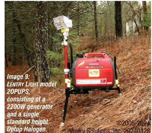
Image 9: LENTRY LIGHT model 20PUPS, consisting of a 2200W generator and a single standard height Optup Halogen.

14128 N Hauser Lake Rd Hauser, ID 83854 USA (888) 257-8967 Toll-free (208) 773-1194 Main info@ventry.com