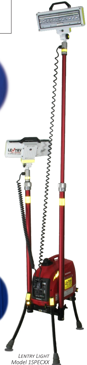
LENTRY LIGHT Model 1SPECXX