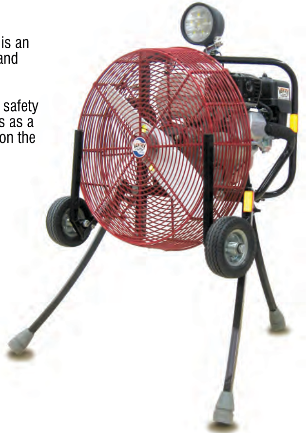
Best selling 20GX160 VENTRY FAN with the optional Entry Point LED. (Optional Medium Flat-Free Wheels & Skids also shown.)